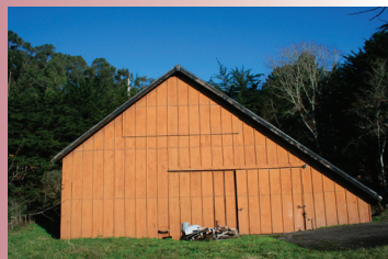
The Farm Bureau also wants to help CR by renovating the old barn on Tompkins Hill Road for educational livestock uses.

The past year has been a remarkable year for changing the look of the Eureka campus. The $18+ million Student Services/Administration/Performing Arts Theater buildings are showing evidence of progress as the steel frame work is forming the outline of the structures. Local bond funds are paying $0.13 for every $0.87 paid by the state on this project. The state has also approved the budget for a $28+ million state-of-the-art project for two academic classroom and laboratory buildings scheduled to begin construction in July 2011. The aging Eureka campus "subterranean" infrastructure will also be getting relief. CR's proposed $33+ million replacement and renovation of electrical, plumbing, drainage, and sewage systems has been tentatively accepted by the state for funding beginning summer 2012.