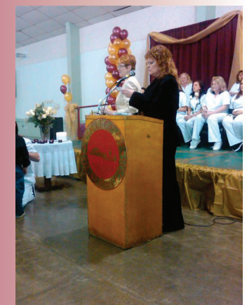
The CR Del Norte Center held its LVN pinning ceremony in December in Crescent City.