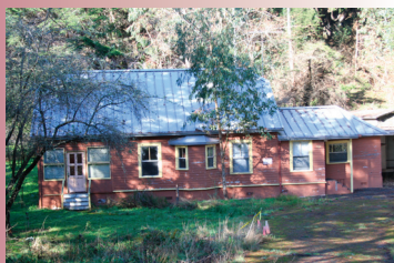
The Humboldt County Farm Bureau has proposed partnering with CR to help renovate the 'Everett' house, above, for use as a residence for agriculture students.

This past year has not only been about managing growth. The District has begun working with community leaders to customize CR's education plans for each campus, education center, and instructional site. Planning documents for the Mendocino Coast and Del Norte Education Centers are being prepared for presentation to the CR Board of Trustees in early spring. In addition to proposing new degrees, such as Environmental Science, and implementing new programs, like the Fire Academy, the District's education master plans are focusing on improving high school outreach efforts, creating more effective college completion strategies, and addressing the severe shortage of health occupation workers in the northwest region. Other education master plans will be initiated next year for the Klamath-Trinity Instructional Site in Hoopa, the Southern Humboldt Instructional Site, the 101 Corridor (Eureka Downtown, Arcata and McKinleyville Instructional Sites), virtual courses, and the Eureka campus.