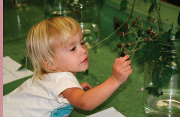
A young girl closely inspects a blackberry plant in a botany classroom during Science Night. CR's 25th Science Night drew a large crowd during a late October Friday evening.